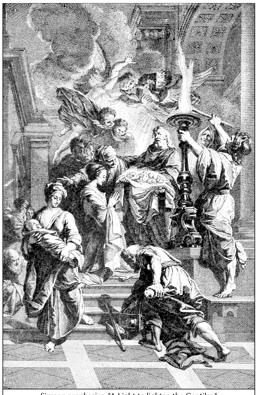
Simeon prophesies: "A Light to lighten the Gentiles." (Spirit of the Holy Bible, 1874)