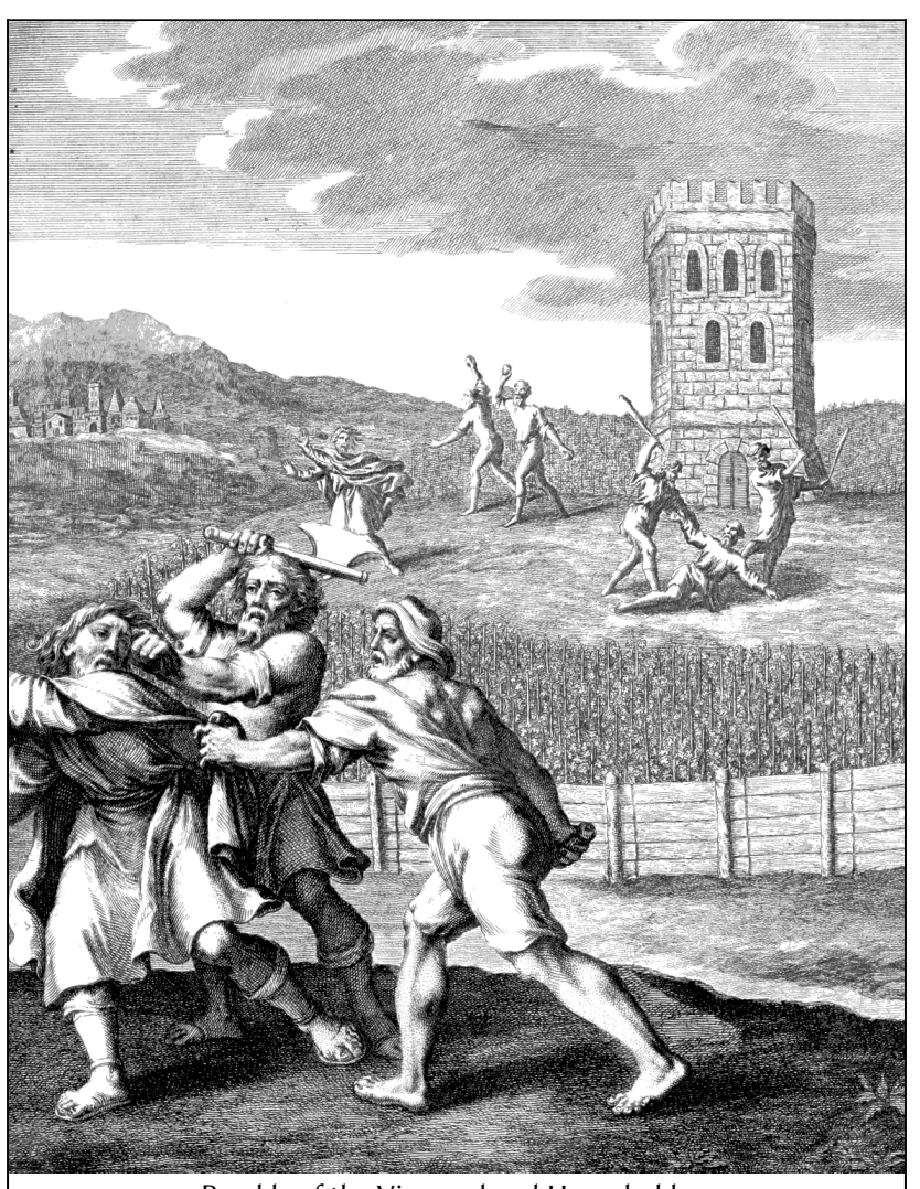
Parable of the Vineyard and Householders (Biblia, 1751)