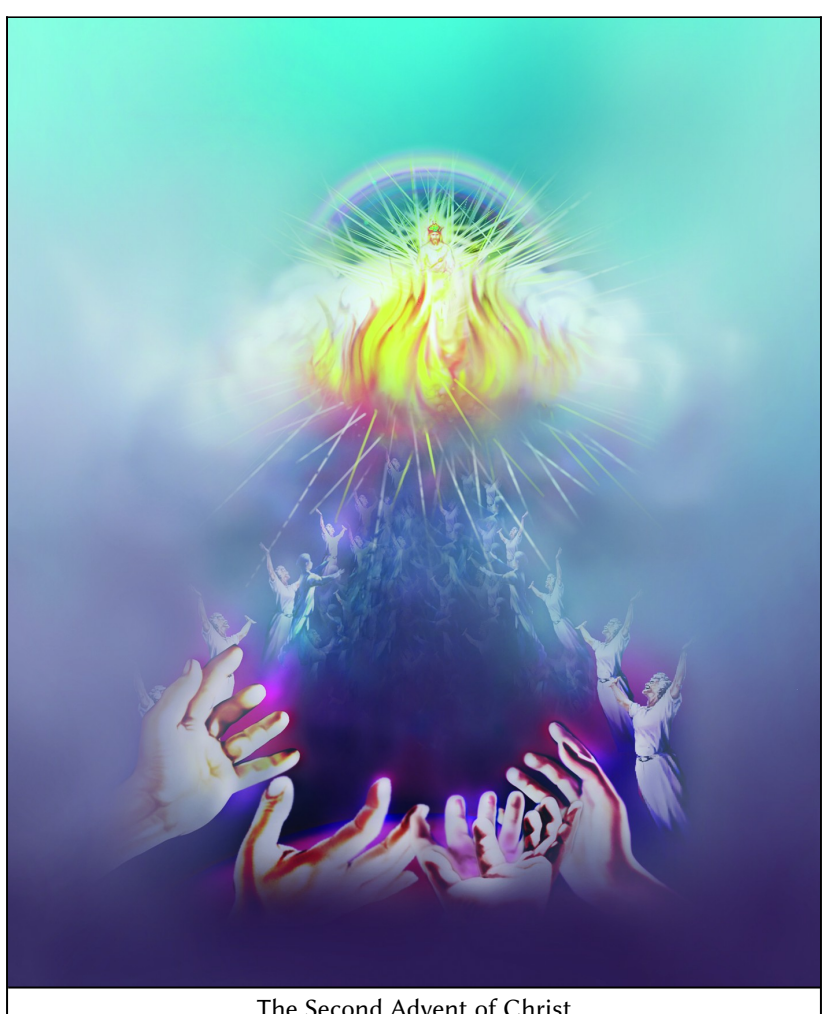
The Second Advent of Christ (Heinrich Halmen, Sabbath Rest Advent Church)