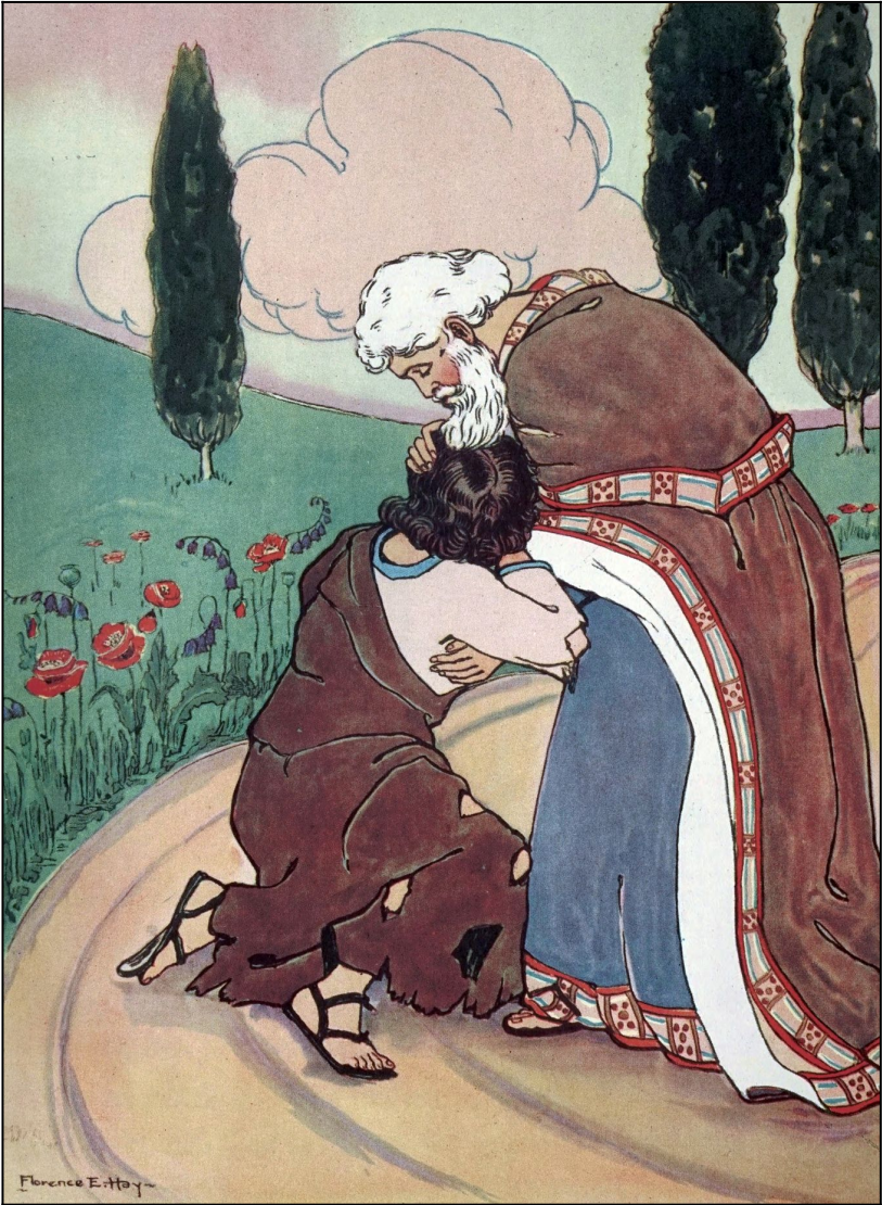
The Father meets the Prodigal Son (Bible Stories in Rhyme, 1923)

dom; for then the service might be of constraint, not willing, and so have the taint of bondage not the fragrance of freedom. Bear in mind that the freedom of which God is the Author and Giver is freedom indeed. Absolutely, infinitely, and eternally it is so.