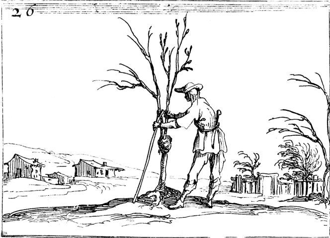
Propping up the Weak Branches (Vitae Beatae – Callot)

no dampening influence that would cause it to be less alive. Even a breath must be only of the breath of life, and it must be breathed so tenderly as to strengthen the faith that is weak and make him who has it a victor. That is the word to you and me.