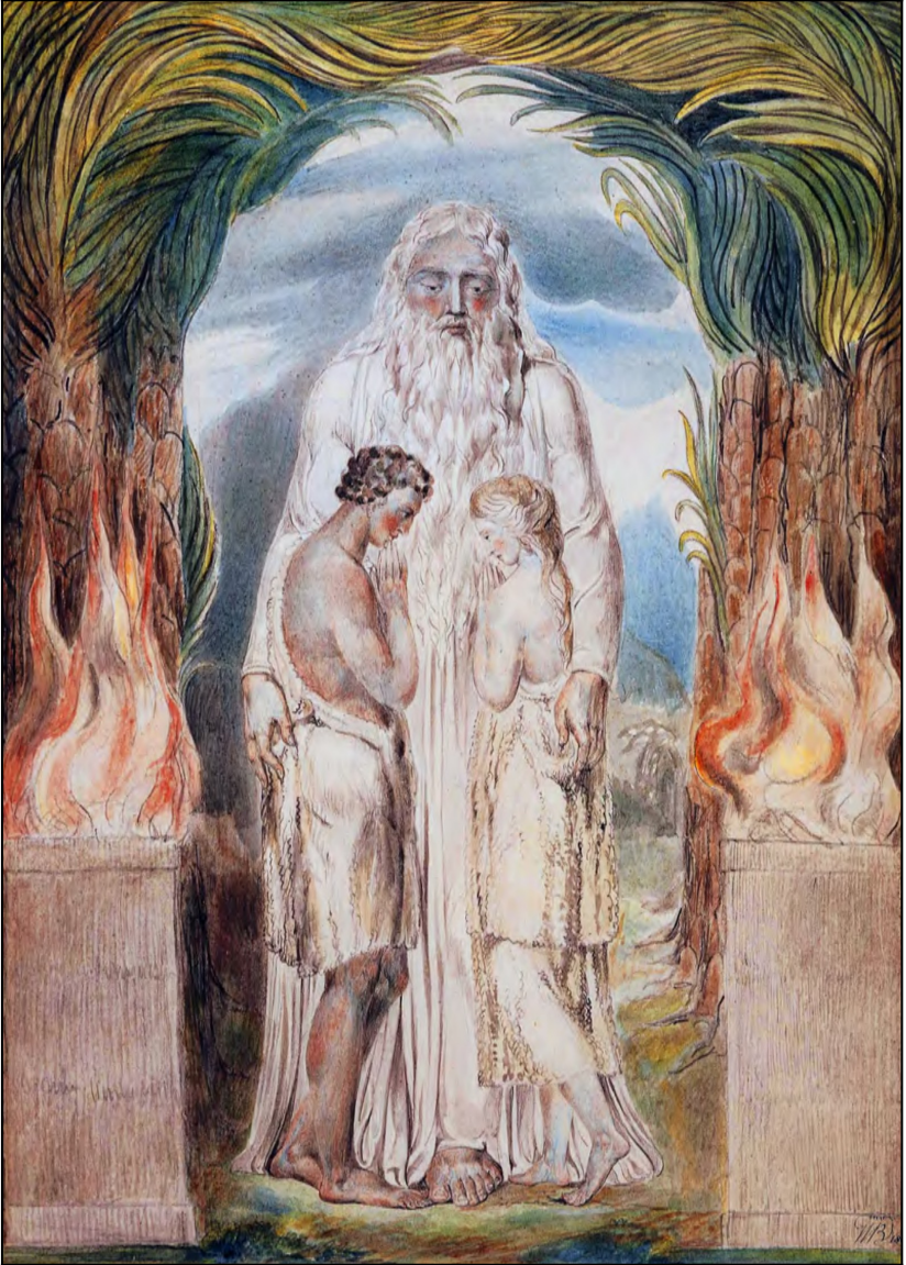
God offers Salvation to the Rebellious (William Blake)

this evil that had been fastened upon man, set the man free again, and bring him to God, where his choice would be on the right side, and he dwell truly with God and in God.