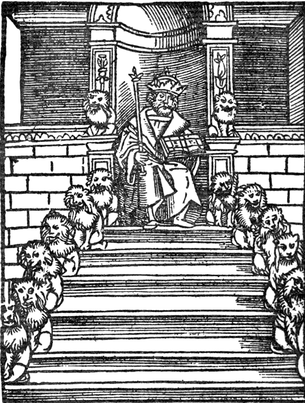
Solomon's Reign began as a Kingdom of Peace (De Houtsneden in Dutch Bible 1528)

And this perpetual hammering during the 400 years of Assyrian supremacy, which was immediately taken up and continued by Babylon, so broke the spirit of the peoples of the earth, that practically there was no further attempt of the conquered peoples to throw off the incubus of imperialism. They submitted to the inevitable, accepted imperial power as final, and left imperialism free to manifest itself fully in the world, and to show what it could do when it had its own way untrammelled and undisputed.