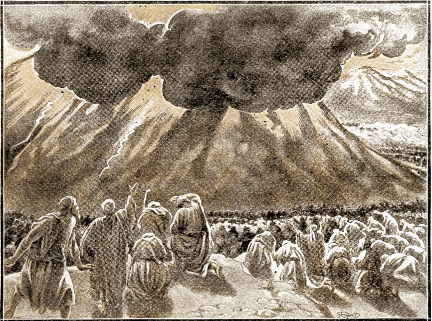
The People make a Covenant at Sinai: Trying to use God's Power for Selfish Reasons (The Coming King 1911)

They failed, as all others must fail, who attempt to use the divine principles for worldly or selfish purposes, for any other than divine purposes, according to the divine will, under the supreme guidance and control of the divine Spirit.