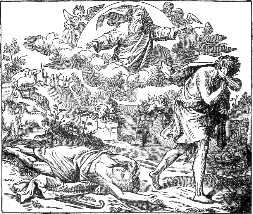
Cain and Abel - Two Types of Government

But apostasy must of necessity go a long way from true and original government—self-government with God—before there could be required such government as that of Nimrod or of Nero.