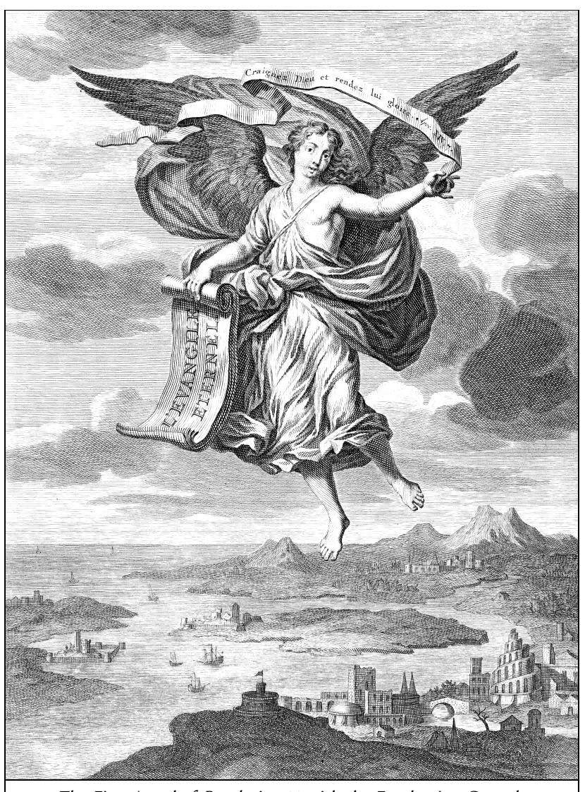
The First Angel of Revelation 14 with the Everlasting Gospel: "Fear God, and give glory to Him."

[van der Gouwen, 1703]