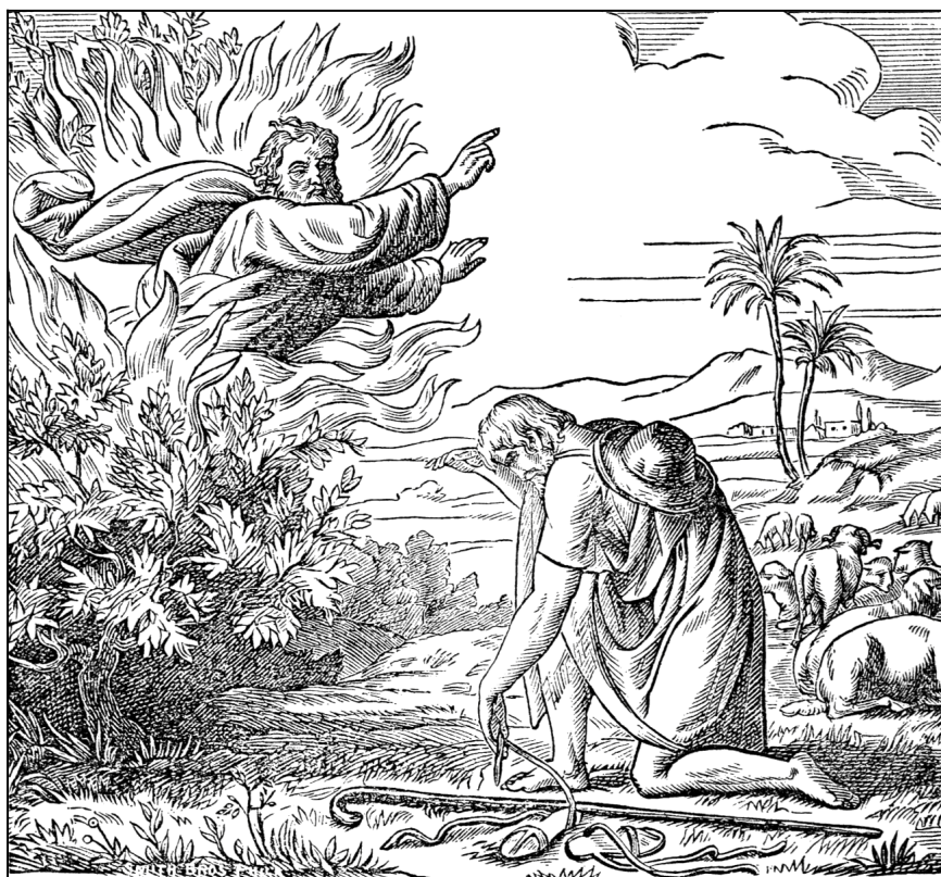
"I AM THAT I AM." Christ's divinity proclaimed at the Burning Bush. (Biblische Geschichte mit Bildern, 1878)