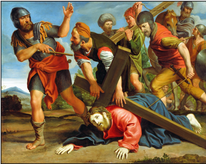
Christ collapses under the Cross (Domenichino, 1610 - Getty Museum)