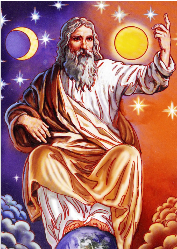
Christ as the Creator (Bible Stories for Catholic Children, 1919)

Our object in this investigation is to set forth Christ's rightful position of equality with the Father, in order that His power to redeem may be the better appreciated.