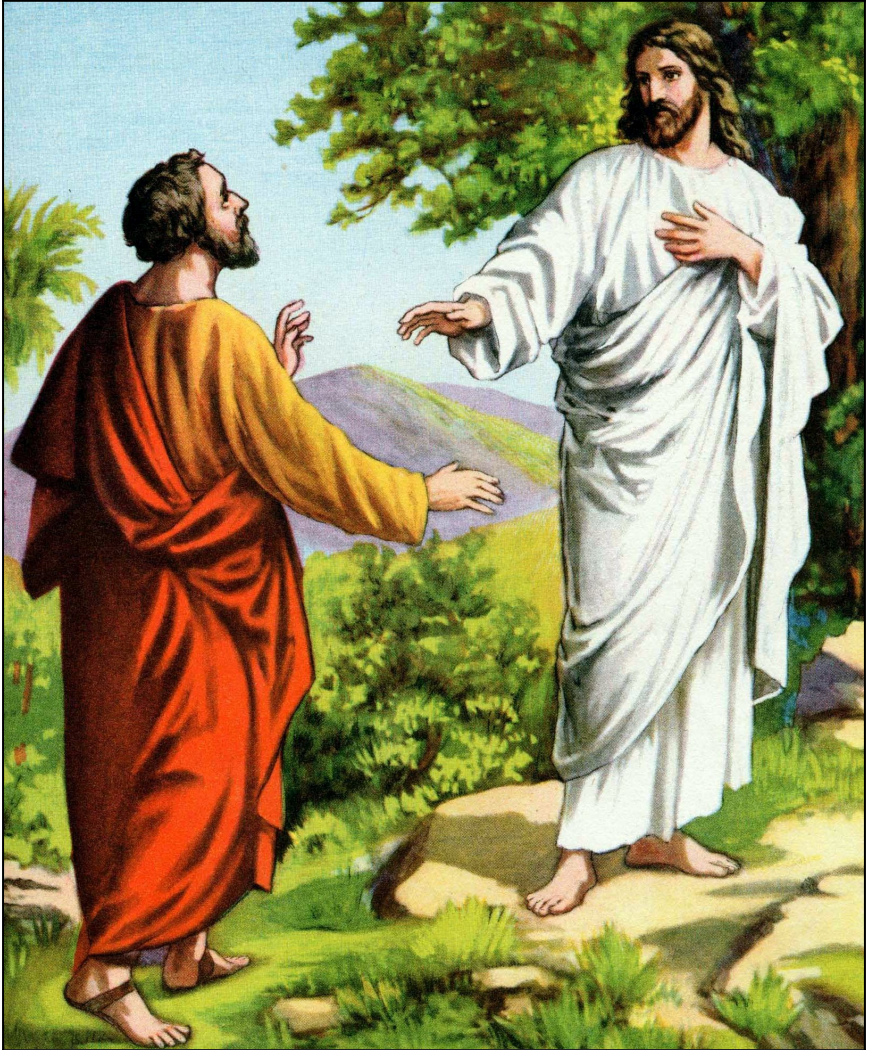
Peter confesses, "You are the Christ, the Son of the living God!" (Children's Bible Cards, 1896-1916)

All that we know of God, we learn through Christ. Let no one, therefore, say that in exalting Christ we are in danger of lowering our ideas of God. That is impossible, for the more exalted ideas we have of Christ, the more exalted must be our ideas of the Father.