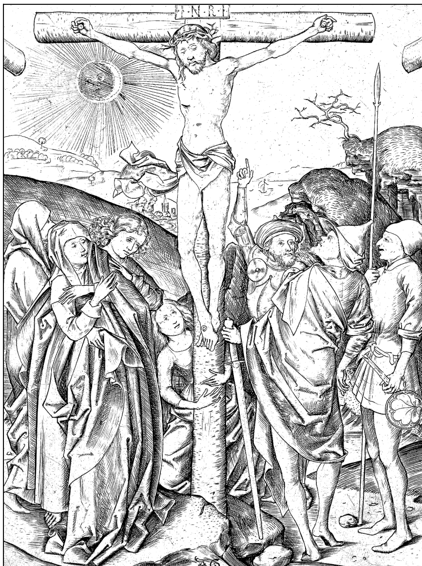
A Centurion professes faith in Christ's divinity at the Cross: "Truly this was the Son of God!" (Monogrammist AG, 15th c – British Museum)