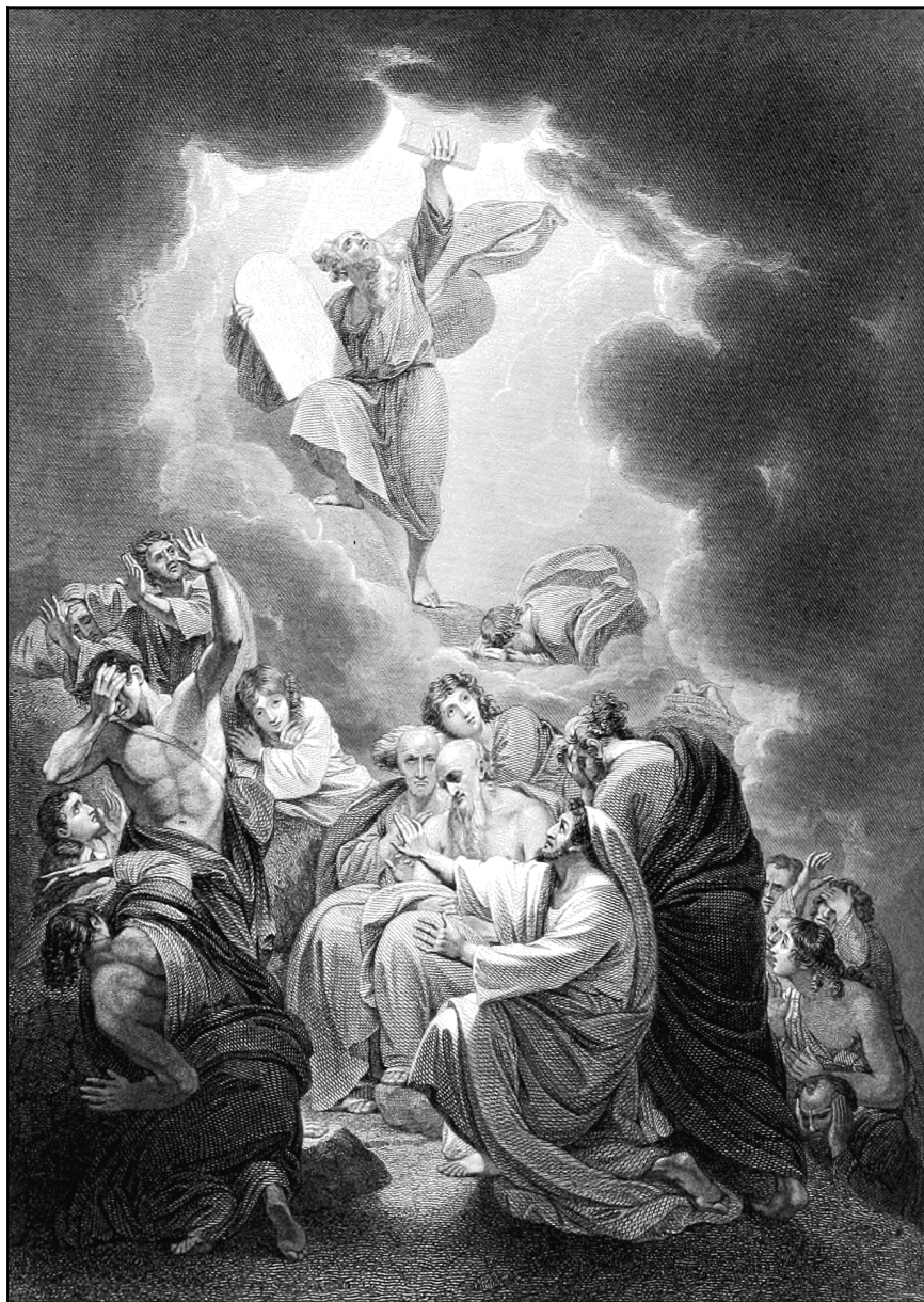
Moses receives the Ten Commandments from Christ (Historic Illustrations of the Bible v2, 1840)