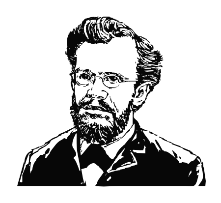
Cover: Gerd Altmann Pixabay