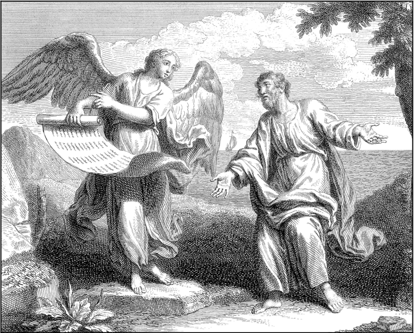
The Angel gives John the Revelation of Christ