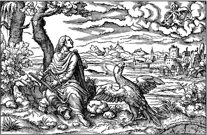
John the Evangelist receives the Revelation of Christ (Bibliche Figuren, 1560)