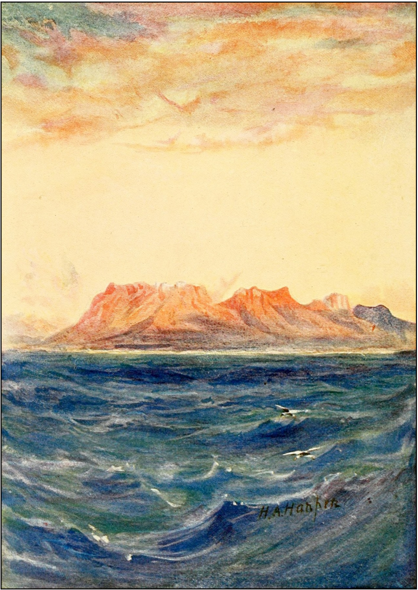
The Isle of Patmos (The Student's Bible, 1911)