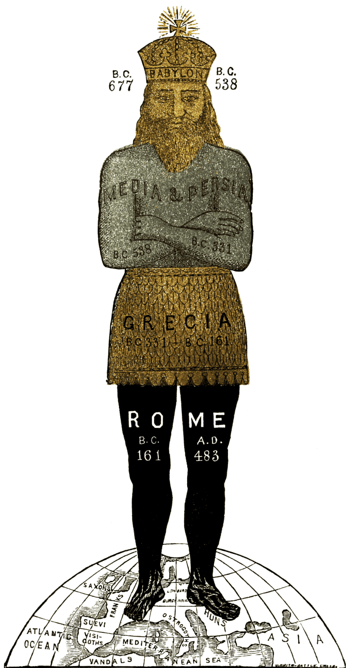
The Great Image