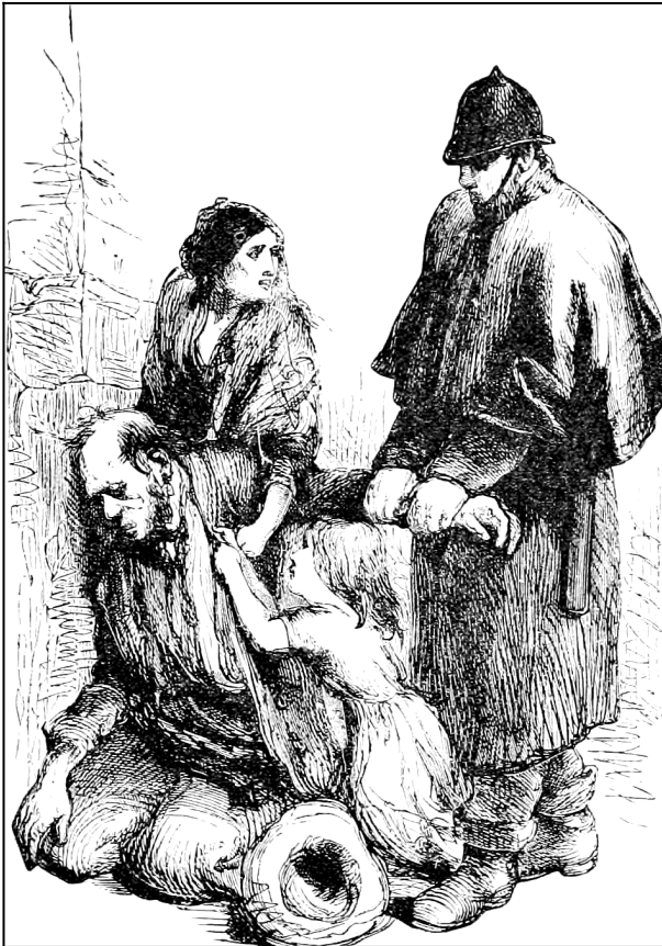
The Misery of the Drunkard (Life of Jesus Christ for the Young, vol. 1, 1880)

A careful examination of the subject will convince any candid man that the support which the advocates of the use of liquor claim to derive from the Bible is wholly imaginary; and that the use which is made of the Scriptures in defense of intemperance is a most flagrant perversion of the language and import of inspiration.