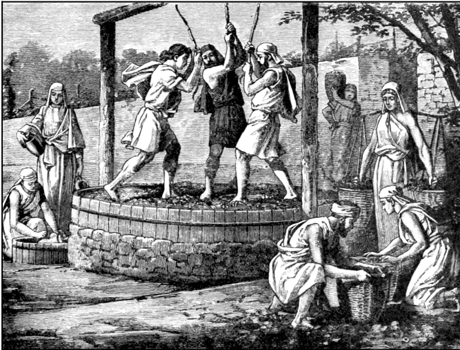
Treading the Grapes - Eastern Winepress (Beautiful Life of Christ, 1889)

31 Look not upon the wine when it is turbid, when it gives its bubble in the cup, when it moves itself upright.