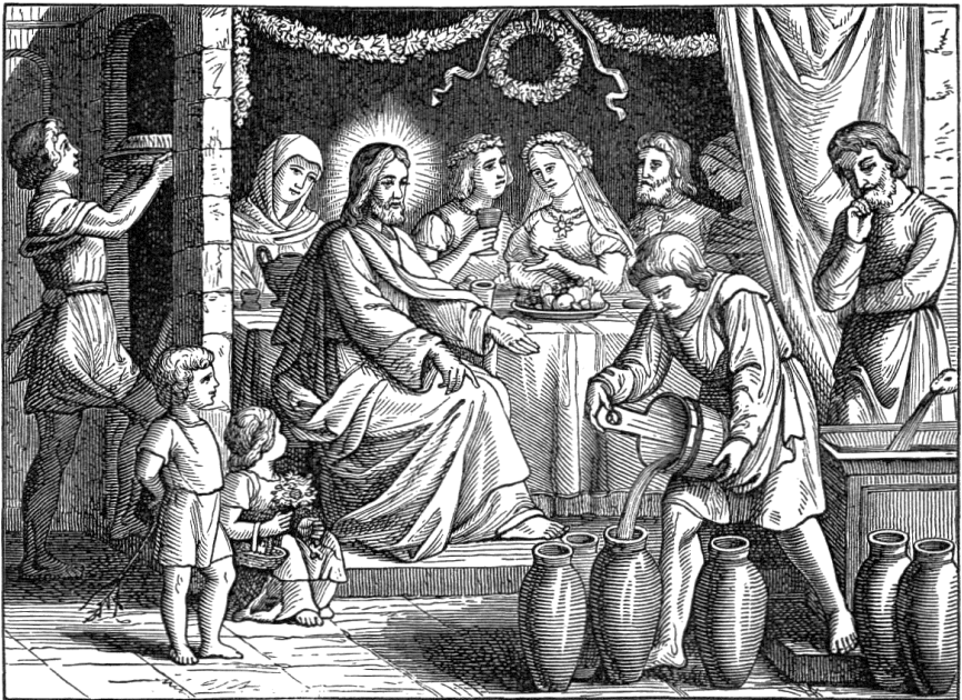
The Wedding Feast at Cana - Water to Wine (Bible Pictures, 1897)

We are now prepared to consider some of the texts in which wine is mentioned.