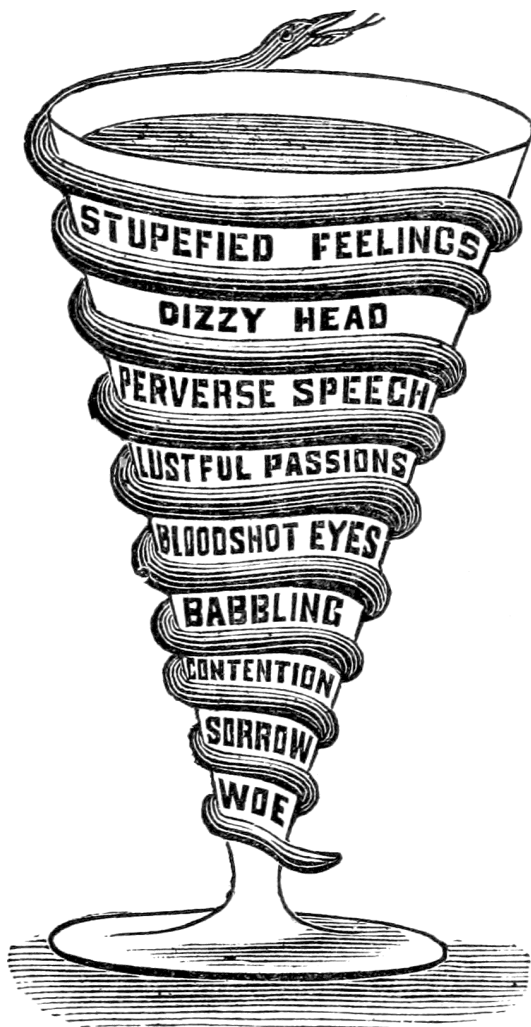
Proverbs 23:29-35: The Effects of Wine (Curiosities of the Bible, 1906)