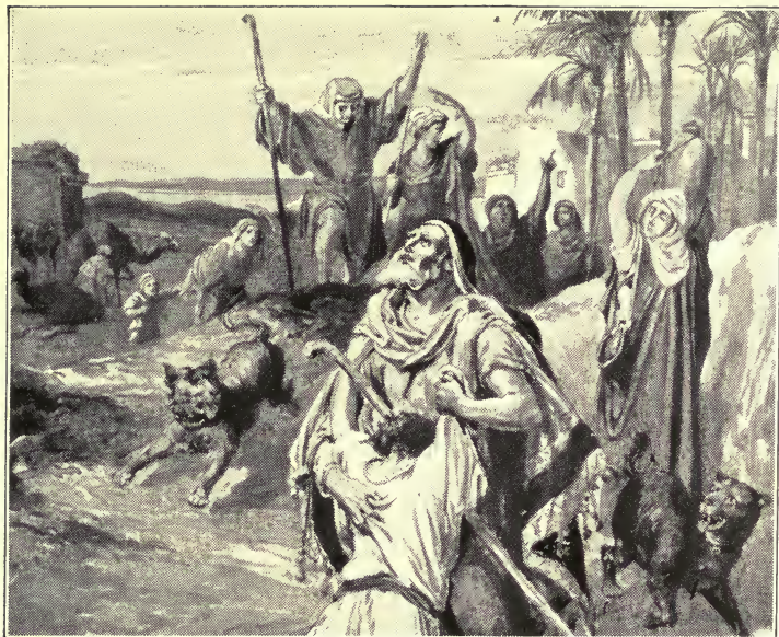
THE PRODIGAL SON'S RETURN

"Father, I have sinned against heaven, and in thy sight, and am no more wor- thy to be called thy son." Luke 15:21.