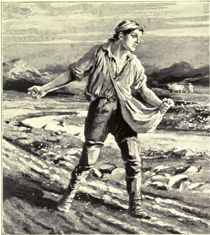
THE GOOD SEED

"He that receiveth seed into the good ground is he that heareth the word, and understandeth it; which also beareth fruit." Matt. 13:23.