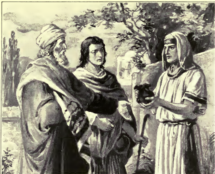
THE CONSECRATED TALENTS

"Well done, thou good and faithful servant." Matt. 25:21.