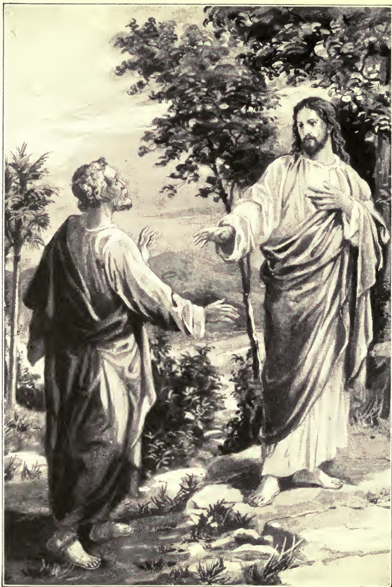
PETER'S GREAT CONFESSION

"Thou art the Christ, the Son of the living God." Matt. 16:16.