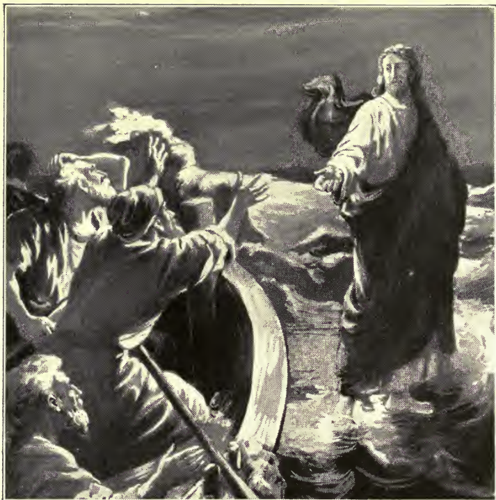
CHRIST WALKING ON THE SEA

"O thou of little faith, wherefore didst thou doubt?" Matt. 14:31.