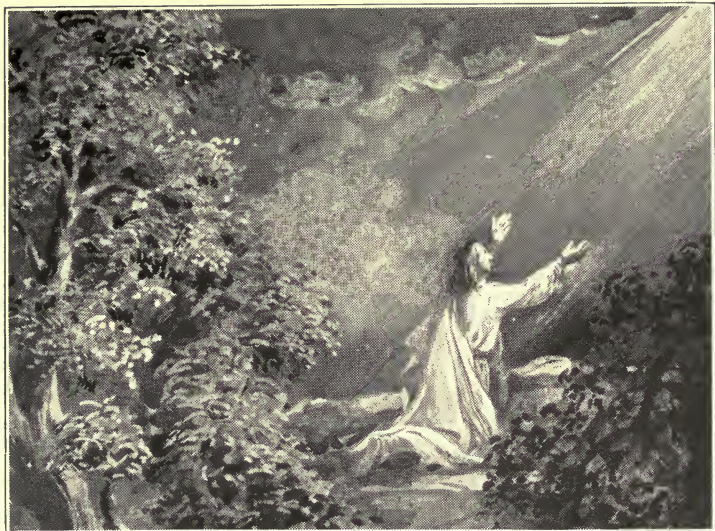
IN THE GARDEN

"Greater love hath no man than this." John 15:13.