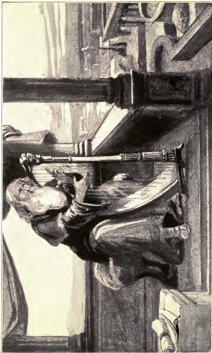
THE SWEET SINGER OF ISRAEL

"Let the righteous be glad; let them rejoice before God: yea, let them exceedingly re- joice." Ps. 68: 3.