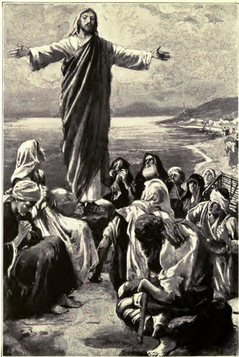
BY THE SEASIDE

"He taught them as one having authority, and not as the scribes." Matt. 7 : 29.