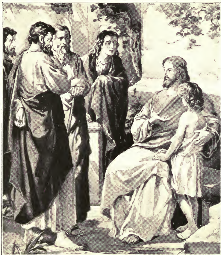
THE MASTER'S IDEAL IN DISCIPLESHIP

not I, but Christ liveth in me: and the life which I now live in the flesh I live by the faith of the Son of God, who loved me, and gave Himself for me.” 16 Rest