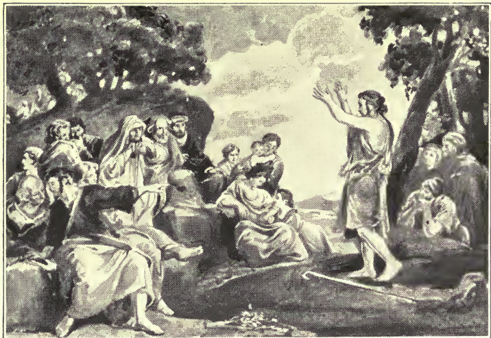
JOHN THE BAPTIST PREACHING

“Repent ye; for the kingdom of heaven is at hand.” Matt. 3:2.