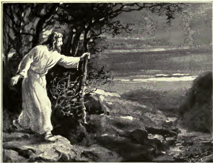
JESUS SEEKING HIS OWN

"The Son of man is come to seek and to save that which was lost." Luke 19:10.