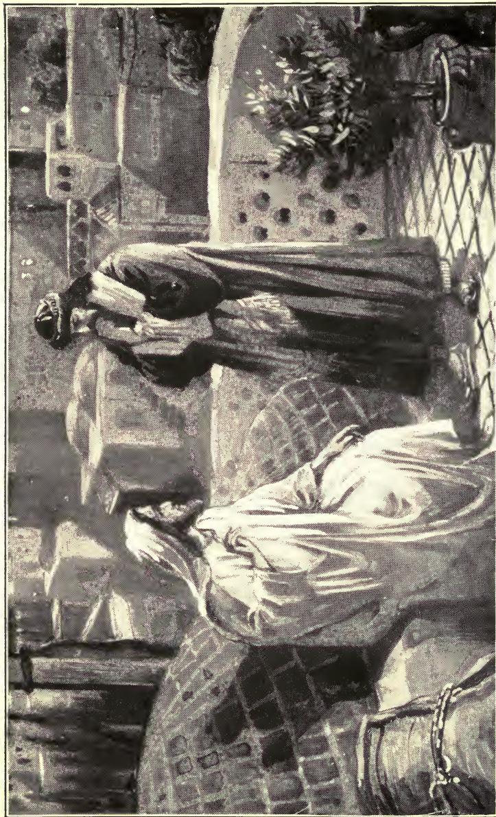
CHRIST AND NICODEMUS

"Except a man be born again, he cannot see the kingdom of God," John 3:3.