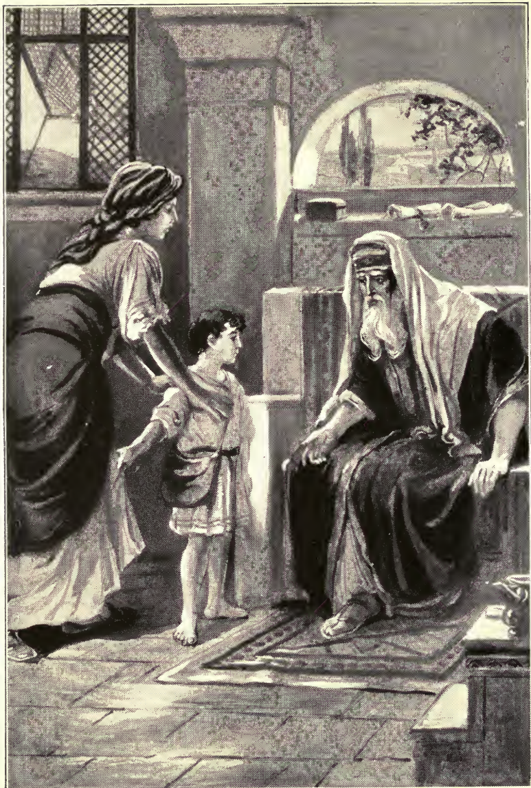
SAMUEL CONSECRATED FOR GOD'S SERVICE

"I have lent him to the Lord; as long as he liveth he shall be lent to the Lord." 1 Sam. 1:28.