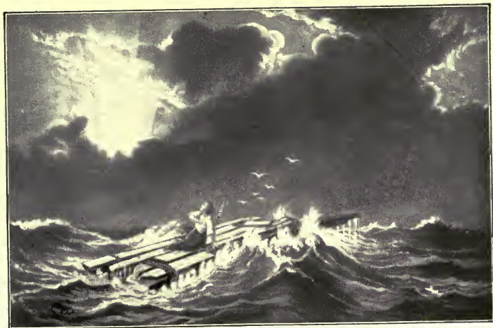
THE LAST PRAYER

"There is a power which man can wield When mortal aid is vain."