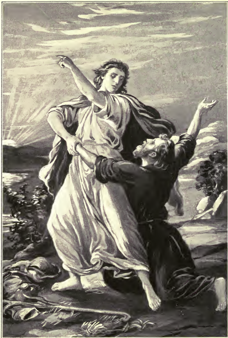
JACOB WRESTLING WITH THE ANGEL

"I will not let Thee go, except Thou bless me." Gen. 32:26.