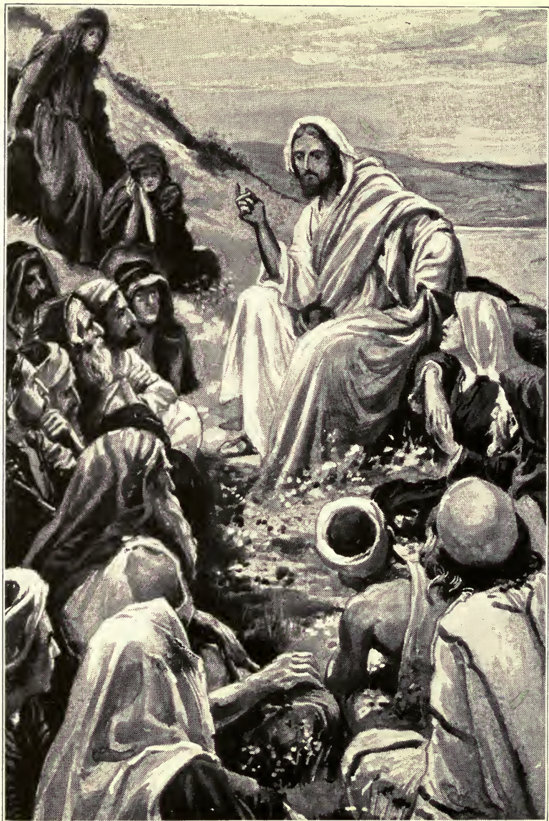
THE GREAT TEACHER

"Never man spake like this man." John 7:46.