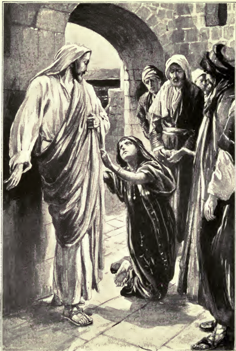
A GENTILE WOMAN'S PLEA FOR HER DAUGHTER

"O woman, great is thy faith : be it unto thee even as thou wilt." Matt. 15:28.