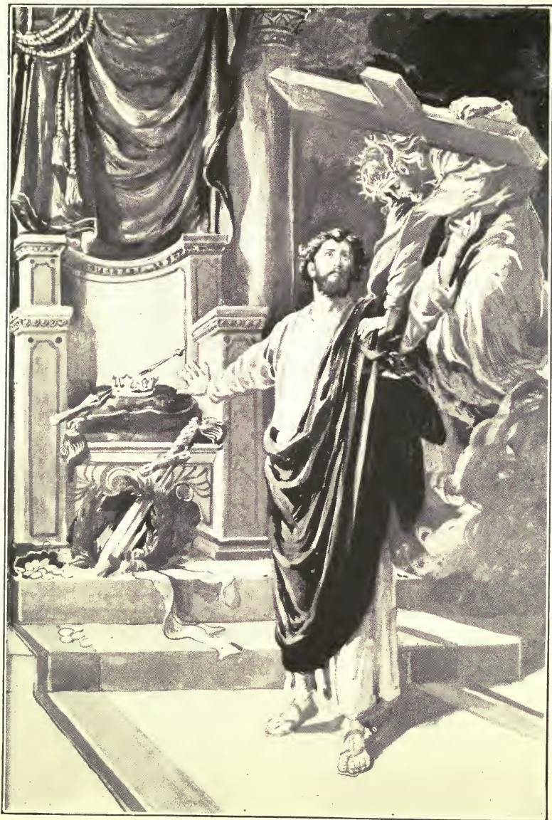
PAUL CHOOSES THE CROSS OF CHRIST

"In the cross of Christ I glory, Towering o'er the wrecks of time." (See Gal. 6:14.)