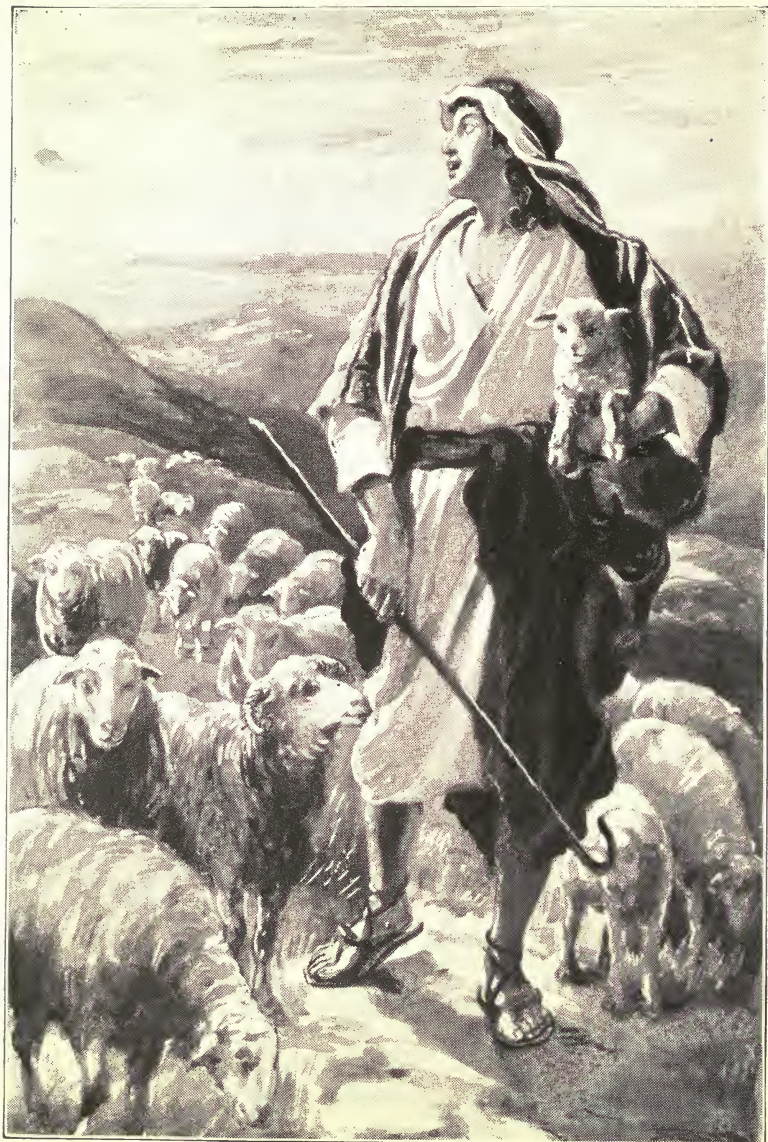
THE SHEPHERD'S CARE

"The Lord is my shepherd; I shall not want," Ps. 23:1.