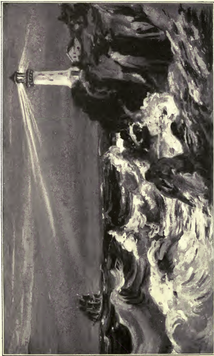
THE BIBLE GOD'S LIGHTHOUSE

"Let the lower lights be burning! Send a gleam across the wave! Some poor fainting, struggling seaman You may rescue, you may save."