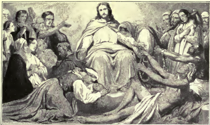
THE CONSOLER OF EARTHLY SORROWS

“He hath sent Me to bind up the broken-hearted, to proclaim liberty to the captives, and the opening of the prison to them that are bound.” Isa. 61:1.