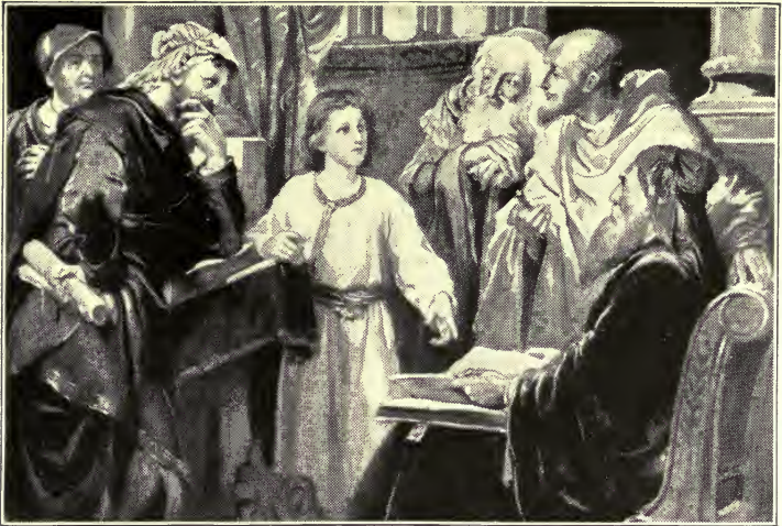
JESUS WITH THE DOCTORS IN THE TEMPLE

"All that heard Him were astonished at His understanding." Luke 2:47.