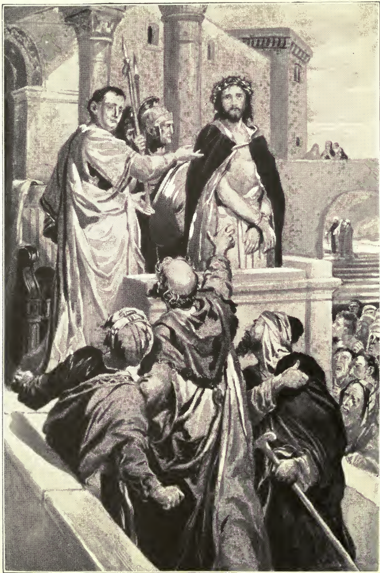
PILATE BRINGS JESUS BEFORE THE MULTITUDE