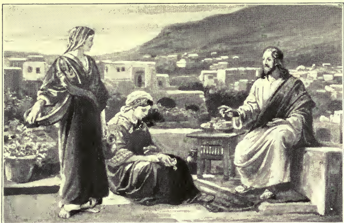
MARY SITTING AT JESUS' FEET

"Mary hath chosen that good part, which shall not be taken away from her." Luke 10:42.