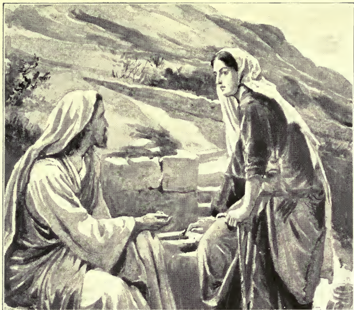
CHRIST AND THE WOMAN OF SAMARIA

"My life of scarlet, my sin and woe, Cover with His life, whiter than snow."