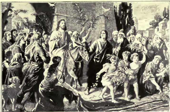
THE TRIUMPH OF "THE SON OF DAVID"

"Rejoice greatly, O daughter of Zion; shout, O daughter of Jerusalem: behold, thy King cometh unto thee." Zech. 9:9.