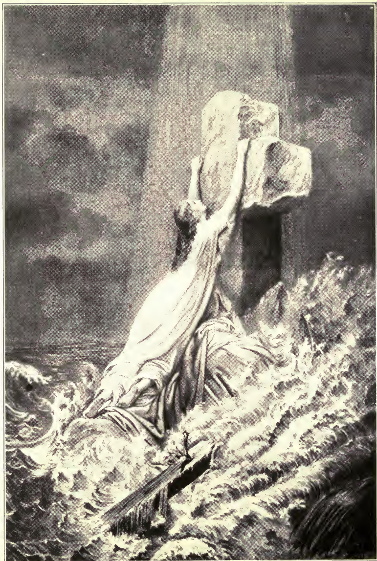
ROCK OF AGES

"In my hand no price I bring; Simply to Thy cross I cling."