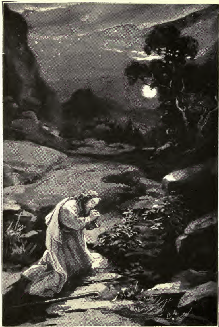
THE PRAYING CHRIST

"He went out into a mountain to pray, and continued all night in prayer to God." Luke 6: 12.