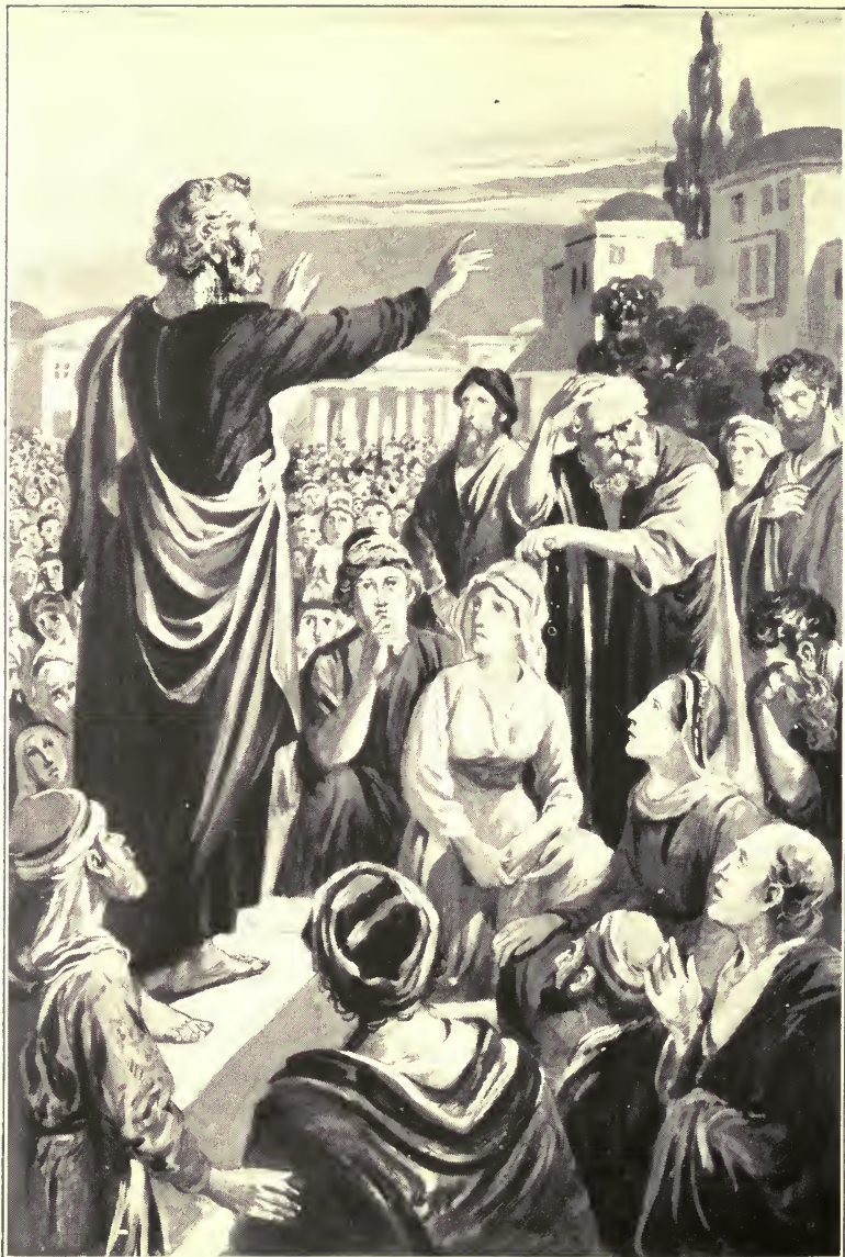
PETER PREACHING AT PENTECOST

"Repent, and be baptized every one of you in the name of Jesus Christ for the remission of sins." Acts 2:38.